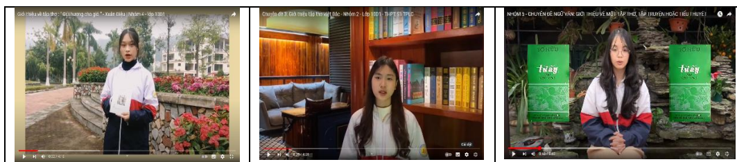
Photo 1: Students from No. 1 High School in Lao Cai City, Vietnam confidently present and introduce a collection of poems, a collection of short stories or a novel

+ Students collect the results and announce the product in front of the class. Then, teachers and students conduct the evaluation. Students can self-assess the project implementation process and self-assess the work of their own group and other groups. Teachers evaluate the entire process of implementing students' projects, evaluate products and learn from experience to implement next projects.