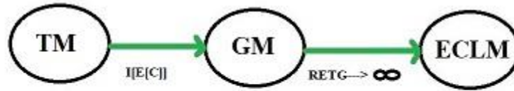
Figure 9 The road from the environmentally dirty traditional market(TM) to the environmentally clean market(ECLM) THAT WAS NEVER BUILT

We can point out based on Figure 9 above that to transition the environmentally dirty traditional market TM to the environmentally clean market ECLM we need to set up first green markets GM and then close the renewable energy technology gap RETG to transition the green market GM towards the environmentally clean market ECLM. We can appreciate two things in Figure 9 above: a) a paradigm shift from environmentally dirty traditional markets TM to the green market GM(TM---→GM) as the environmental externality E[C] produced by the traditional market is now internalized I[E(C)]; and b) a paradigm transition from green markets GM towards environmentally clean markets ECLM as the renewable energy technology gap RETG is closed(RETG--→ ∞ ). Finally, Figure 9 summarizes the road from environmentally dirty traditional markets TM to the environmentally clean markets that was never build since 2012 Rio +20 to today when addressing environmental pollution was made the priority development issue by the United Nations Conference on Sustainable Development.