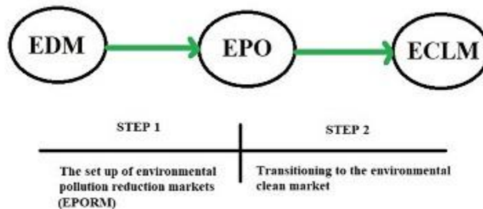
Figure 5 The steps to take to construct the road from the environmentally dirty market(EDM) to the environmentally clean market(ECLM)

Building the transition road from environmentally dirty markets(EDM) to environmentally clean markets(ECLM) requires first the implementation of environmental pollution reduction markets(EPORM) to address the root cause of the environmental pollution problem(EPO), and then transition this pollution reduction markets(EPORM) from fully or dominant non-renewable energy based economies to fully or dominant renewable energy based economies closing that way the renewable energy technology gap(RETG), a situation pointed out in Figure 5 below: