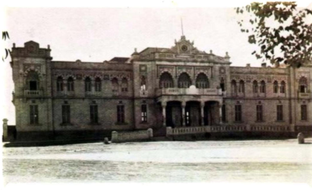
Fig. 3 al-Hijaz Train Station

Pictures streamed on the computer screen in front of the students; there was also a list of names of buildings. The students had to match the title Old Train Station "al-Hijaz" to the correct picture, they chose: