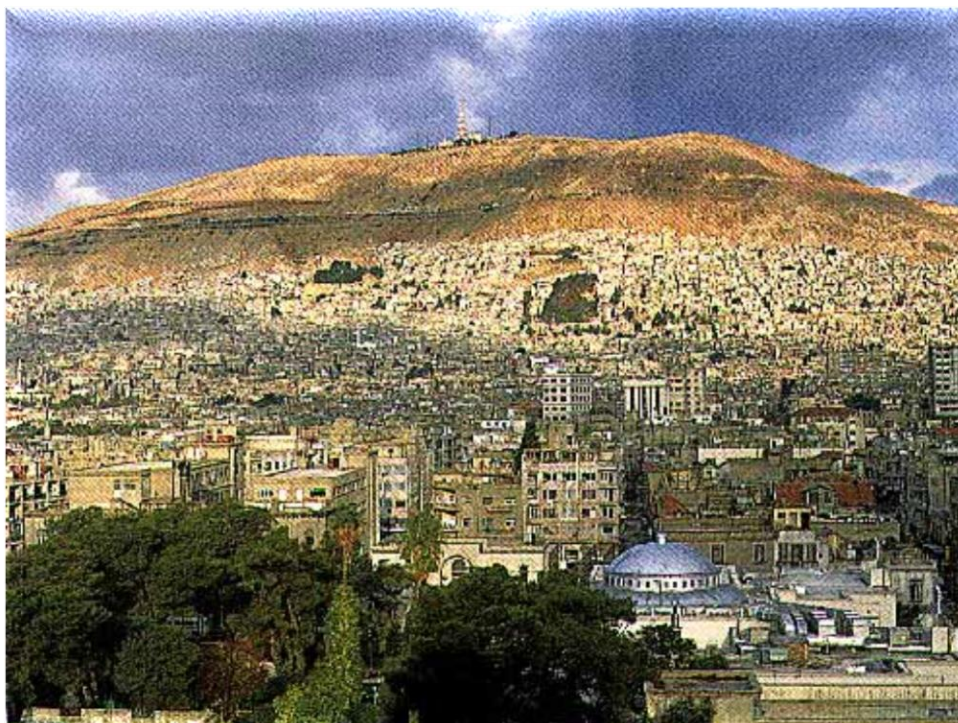
Fig. 6 Ancient Damascus.

The students compared the two pictures in terms of view, scenery and monumental structures visible in the skyline. For instance, Mount Qasioun, which ruled the skyline in the ancient city