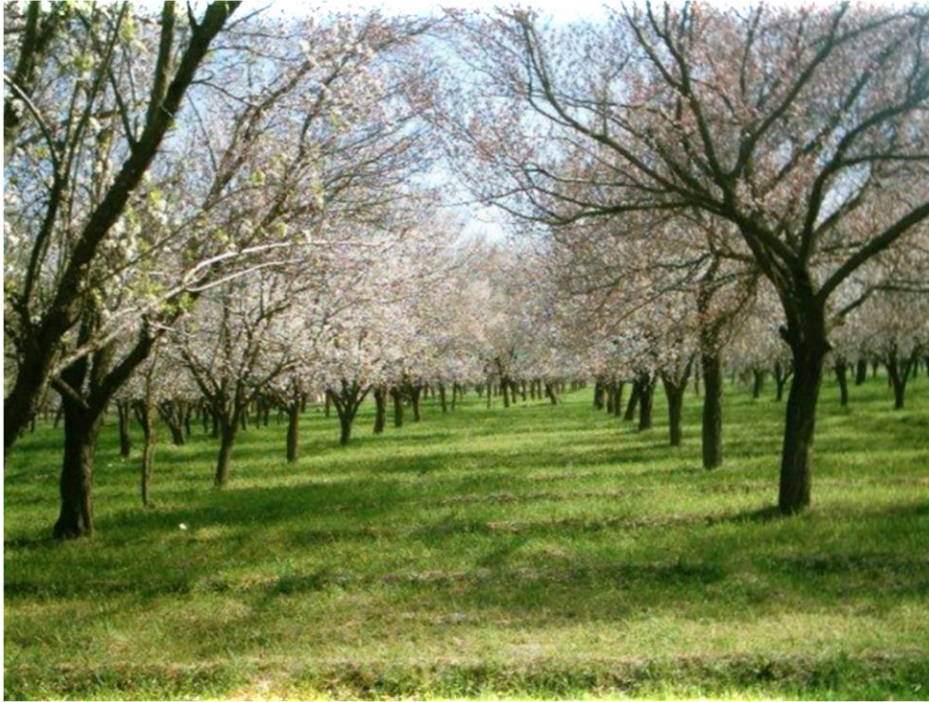
Fig. 7 al-G'utta

picture, has been covered by high building. Students could actually see the forest of cement; hence, the author's argument became concrete and understandable.