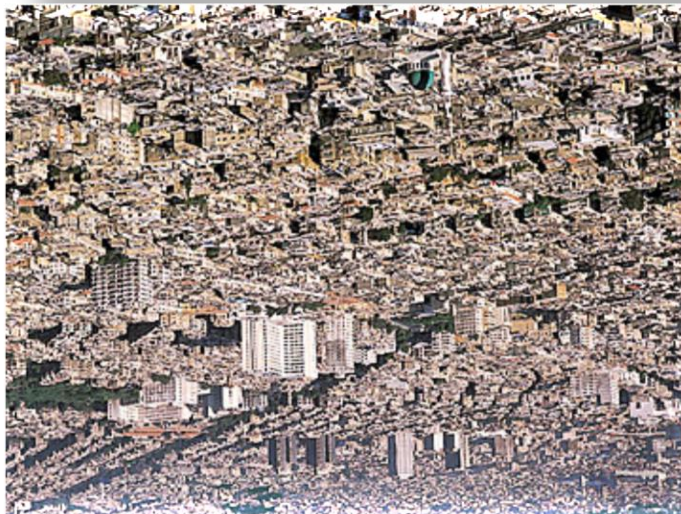
Fig. 5 Damascus today, a city that has lost its identity.