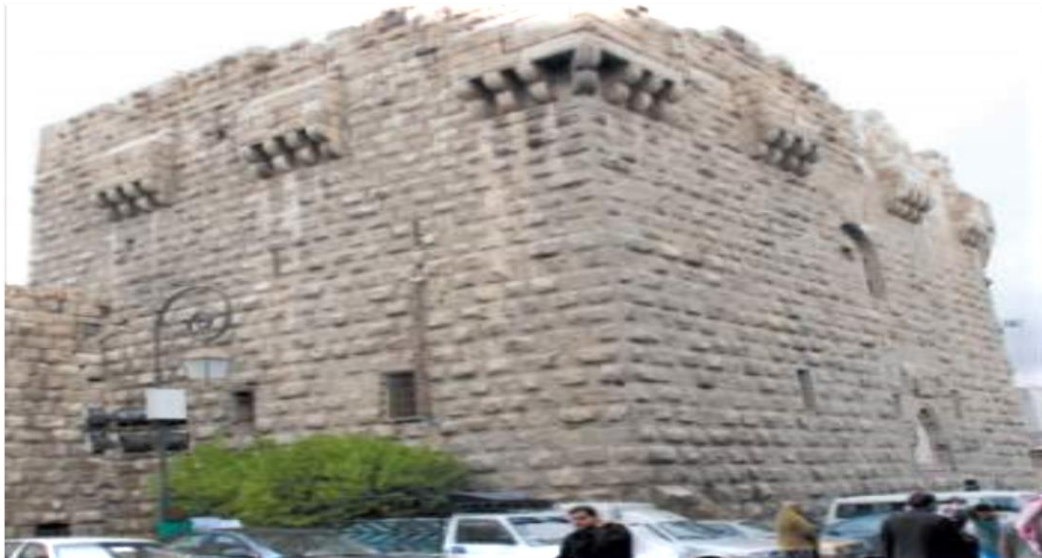
Fig. 1 Salah al-Din's Fortress